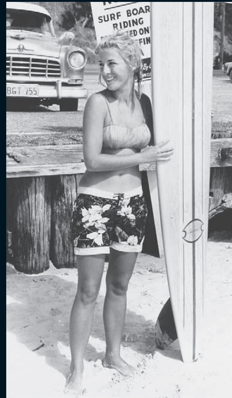
• five. Final Wave, Midget Farrelly [ winning ] at the first World Championships, Manly. 1964. • six. Femlin, Kirra, QLD. 1963.

email enquiries to: enquiries@mediacentre.com.au